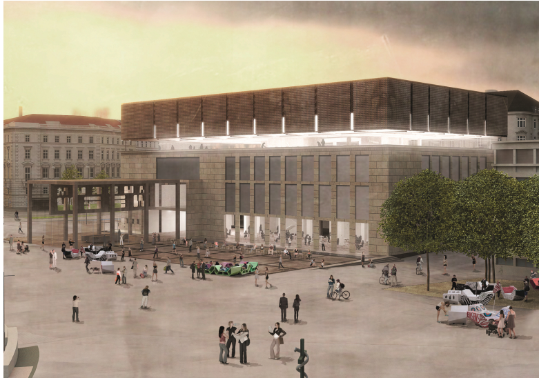
© Winkler, Ruck, Certov, rendering WIEN MUSEUM NEU

The architecture team's design takes on new shapes - by using a free, functional extension on top of the existing building - with horizontal joints linking old and new. The first and second floors can therefore house permanent exhibitions, while the raised top floor will be home to various special exhibitions. A Vienna room will be built on the joint floor and the wrap-around balcony will provide views over the whole of Karlsplatz.