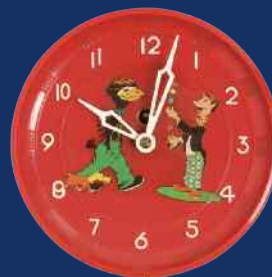
Wall-mounted clock for children's room, c. 1950

The Vienna Museum of Clocks and Watches was founded in 1917. Most of its exquisite holdings stem from two private collections: the first was amassed by Rudolf Kaftan, a secondary-school teacher and the museum's first director; the second was the precious pocket watch collection of writer Marie von Ebner-Eschenbach.