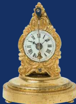
Miniature „Zappler” table clock, c. 1830, Johann Rettich, Vienna H.: 40 mm, Ø: 30 mm