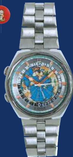
World time wristwatch, 1970