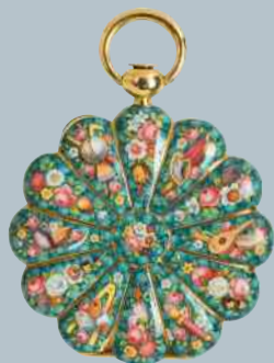
Pocket watch, early 19th century, Blondel & Melly, Geneva