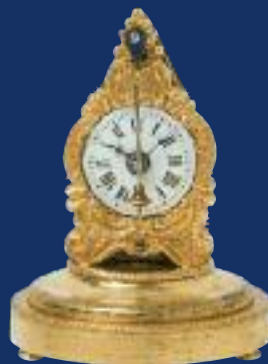
Miniature „Zappler“ table clock, c. 1830, Johann Rettich, Vienna H.: 40 mm, Ø: 30 mm