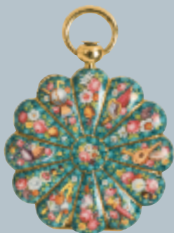
Pocket watch, early 19th century, Blondel & Melly, Geneva