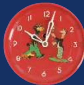
Wall-mounted clock for children's room, c. 1950

The Vienna Museum of Clocks and Watches was founded in 1917. Most of its exquisite holdings stem from two private collections: the first was amassed by Rudolf Kaftan, a secondary-school teacher and the museum's first director; the second was the precious pocket watch collection of writer Marie von Ebner-Eschenbach.