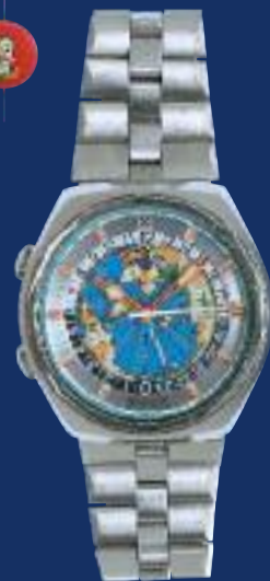
World time wristwatch, 1970