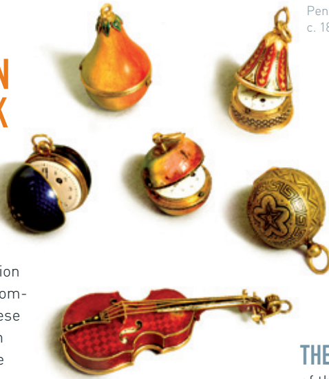
Pendant watches, c. 1810

of a visit to the museum is the astronomical art clock by David a Sancto Cajetano from the eighteenth century. Besides telling the time, this technical masterpiece informs on the length of the day and the orbital phases of the planets, and with sensational precision. The world-famous "Laterndl" (lantern) clocks are witnesses of the heyday of the Viennese art of clockmaking. The smallest clock is a "Zappler" (with "fidgety" front pendulum) and fits under a thimble; the heaviest example is the turret clock of St Stephen's Cathedral, of solid cast iron. Viennese Biedermeier and the Belle Époque are represented in a multitude of different models.